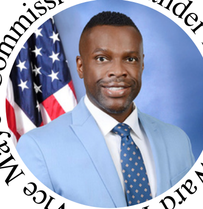
Vice Mayor/Commissioner Xander Harcourt - Ward 1