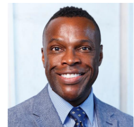
COMMISSIONER, WARD 1 XANDER HARCOURT