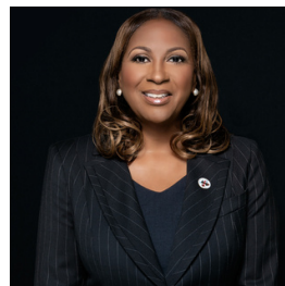
MAYOR CYNTHIA MILLER